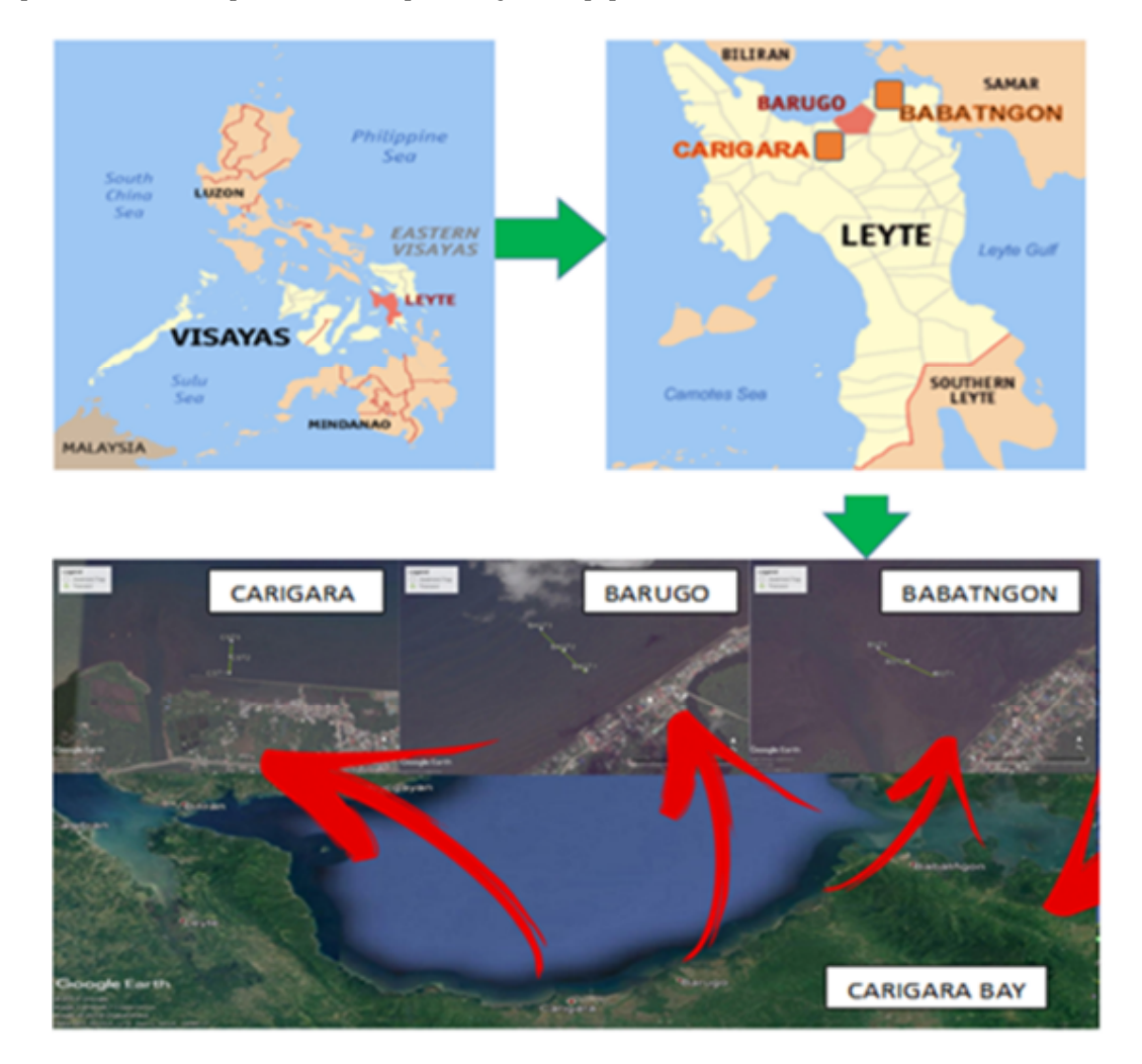
Figure 1. Study Site

book of Water Invertebrates<sup>(2),(7)</sup> and the writing of the nomenclature following the World Register of Marine Species (WoRMS: http://www.marinespecies.org/index. php).